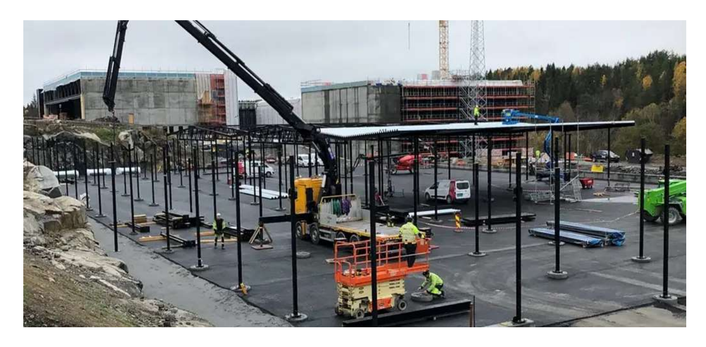
PNB -Oppegård - Metacon