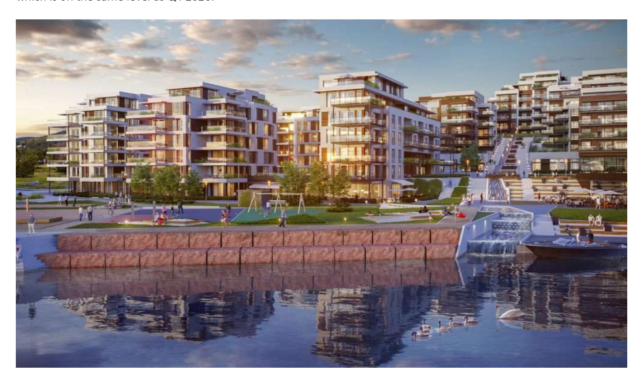
Nordre Jarlsberg Brygge, Sande, Alento AS

Health, Safety and Environment is a core focus area for Frigaard Property Group. Our ambition is zero injuries. The group is constantly working to make sure everybody that works for- and with us gets home safely to their families everyday. During fourth quarter 2021 we are happy to once again report that we had no injuries to our workers, which is on the same level as Q4 2020.